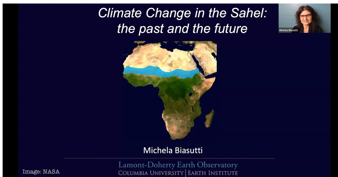
A screenshot of the Third Joint WCRP/WWRP CLIVAR/GEWEX Monsoon Panel Webinar Series on African Monsoons held on 6 th March 2024