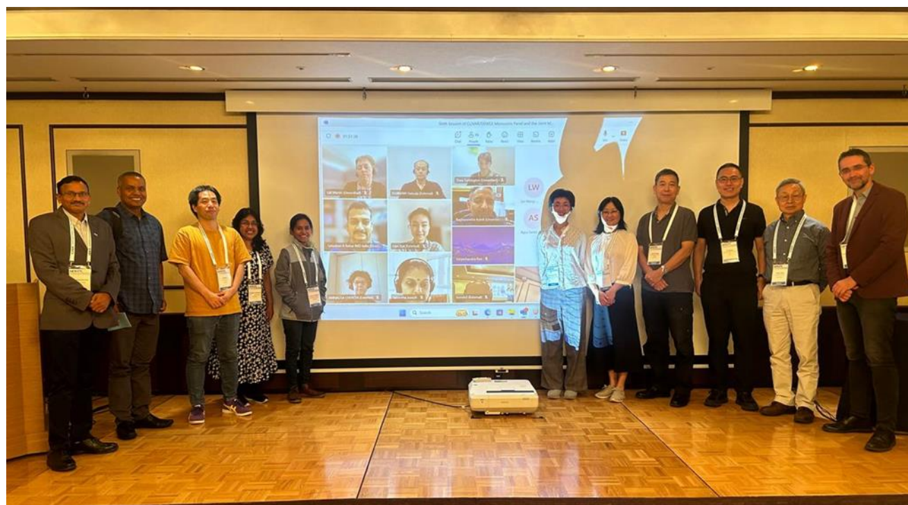
Photos of the in-progress Sixth Session of CLIVAR/GEWEX Monsoons Panel held in hybrid mode on 11 th July 2024 at Sapporo, Japan