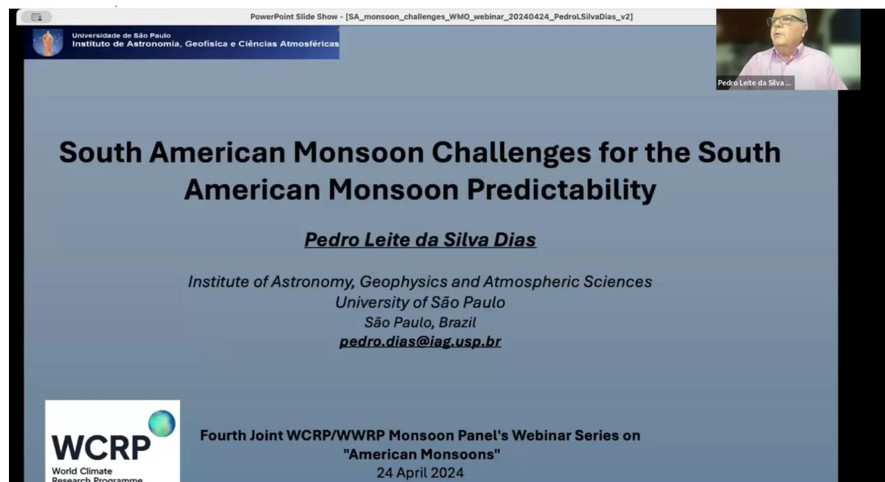
A screenshot of the Fourth Joint WCRP/WWRP CLIVAR/GEWEX Monsoon Panel Webinar Series on American Monsoons held on 24 th April 2024